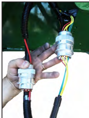
Figure 6 - Attached Harnesses