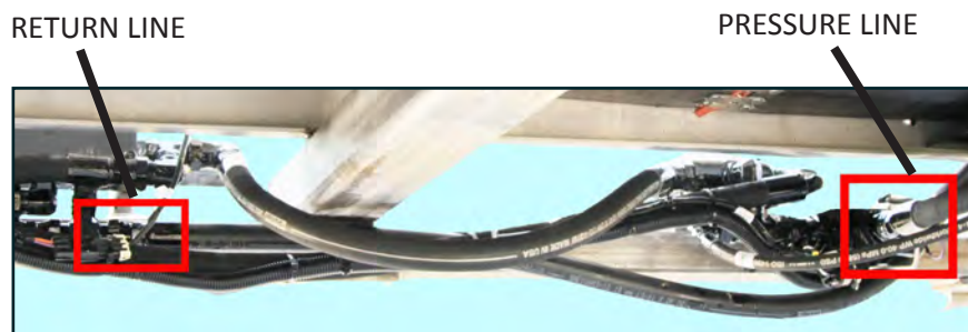
Figure 1 - Return Line and Pressure Line Hydraulic Hoses