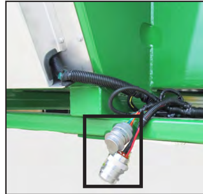
Figure 5 - New Box Harness Location