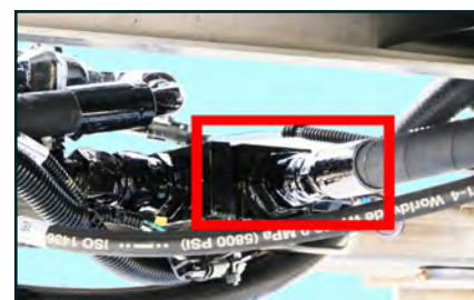
Figure 3 - Detail Pressure Line