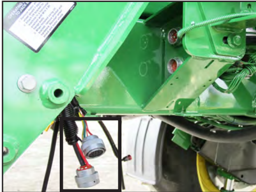
Figure 4 - Used Box Harness Location